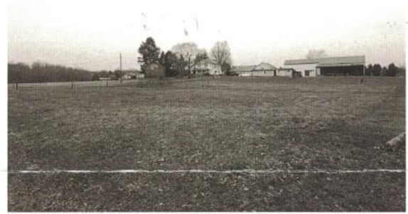
The Appelget Farm

Don't forget to renew your membership every year!