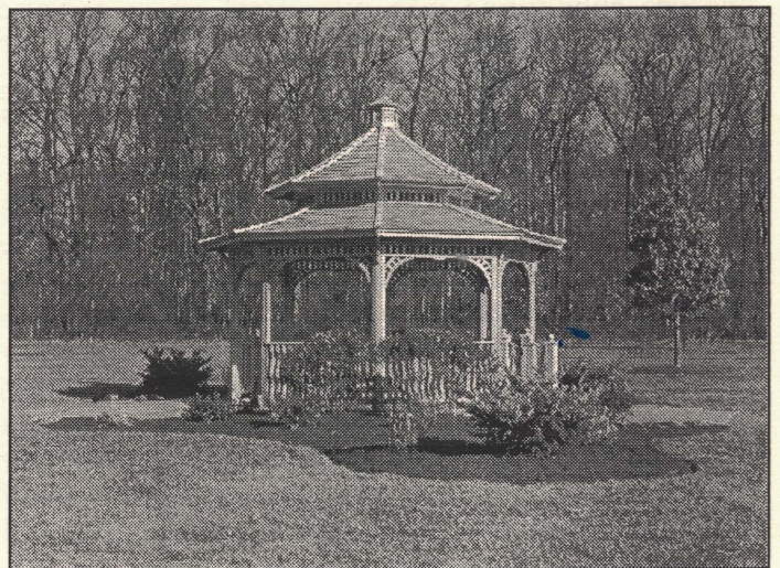
The Woodbury Memorial Gazebo